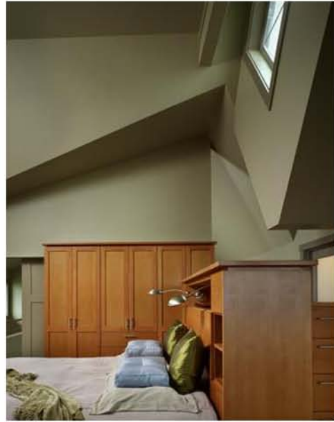
The master bedroom has dormers, built-in storage and a little balcony off the back. Just outside the bedroom door is a sitting room.