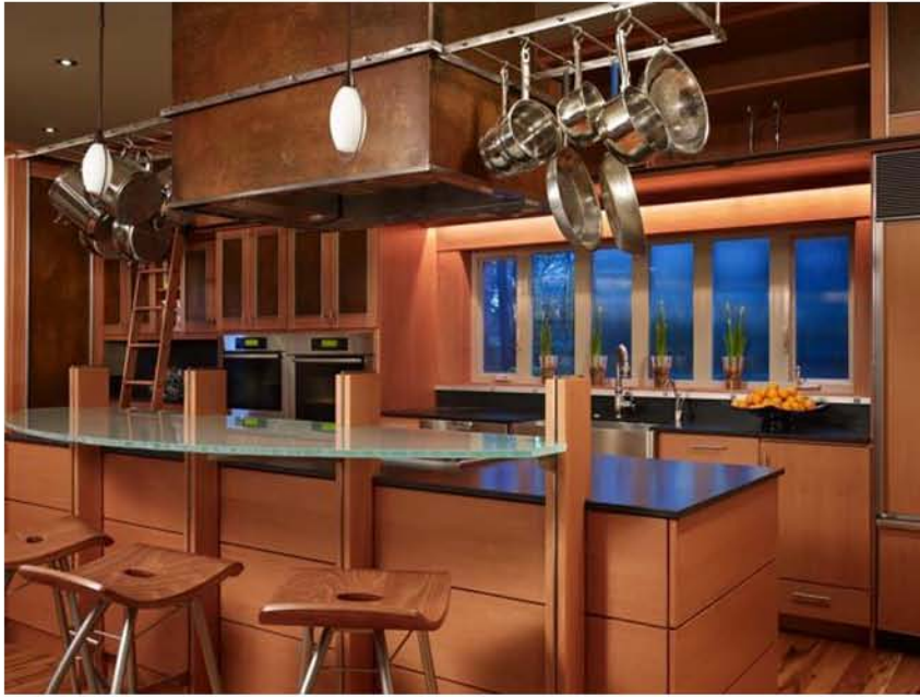
The kitchen runs the width of the house, with a lighted metal pot rack, black honed-granite countertops and glass demi-lune breakfast bar. A rail-mounted library ladder slides back and forth to reach the kitchen's high cabinets. Several of the windows over the sink are frosted for privacy.

So how did Baker pull it off? He listened closely to his clients, and came up with a dramatic, open-plan house rich in warm woods, copper and glass. The rooflines are steep enough to make any cottage-lover happy. The palette, chosen with help from interior designer Dixie Stark, perfectly suits Nancy's red hair and brown eyes.